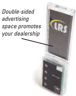
Double-sided advertising space promotes your dealership