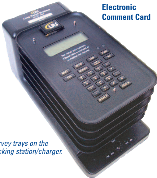
Survey trays on the docking station/charger.